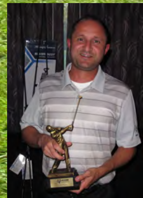
Longest yard – Men