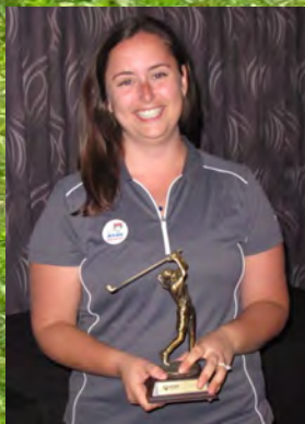
Longest yard – Women