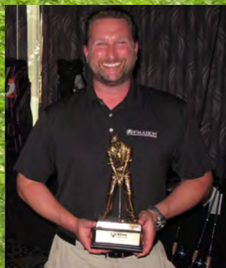
Closest to the Hole