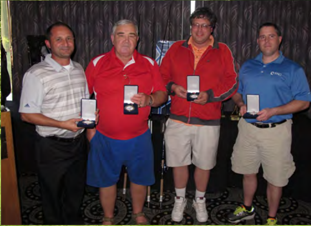
THE WINNING TEAM