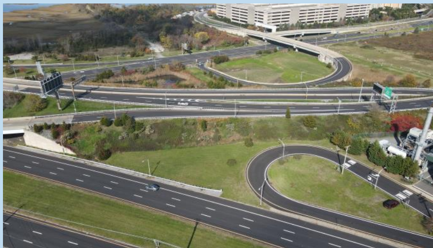
Aerial view of the newly resurfaced Atlantic City Expressway Connector.

Complicating the project were two large utility projects by South Jersey Gas (Brigantine Redundancy) and Atlantic City Electric (Harbor Beach Redundancy). Both utilities were upgrading their facilities within the Connector area to provide redundancy to Atlantic City and Brigantine City. Unfortunately, they were not able to complete their utility upgrades within the project area before the resurfacing began, requiring adaptation and coordination by RVE and South State, Inc. to ensure resurfacing was performed before utility work was completed within the pavement areas. Some other project obstacles that had to be overcome included significant asphalt and fuel price escalations; a water main break with pavement; paving within the tunnel confined to a 14-foot clearance and leveling course to address a poor transition across the adjacent railroad crossing, requiring close coordination with NJ Transit.