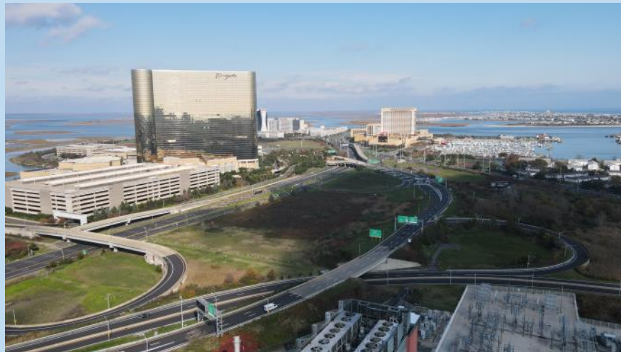
The Atlantic City Expressway Connector was designed to connect the Atlantic City Expressway with Brigantine City and planned casino development in the Marina District of Atlantic City.

Remington & Vernick Engineers (RVE) provided engineering design and construction management services to the South Jersey Transportation Authority (SJTA) for the Atlantic City Expressway Connector Resurfacing. RVE also provided the initial budget cost for the project to the SJTA under their general engineering consultant contract. The Connector is a series of mainline roadways (including portions of State Rt 30, 87 and 187), ramps, bridges, tunnel and local roadways. Its purpose was to connect the Atlantic City Expressway with Brigantine City and planned casino development in the Marina District of Atlantic City. Originally completed in 2000, the Connector had not been resurfaced in any manner since its inception. It encompasses approximately 15 miles and 40 lane miles and includes one of the two tunnels present in New Jersey. The Connector has very few tangent sections of roadway and numerous on-off ramps confined to a small section of land in the Uptown, Midtown and Marina Districts of Atlantic City. It has traffic signalized intersections and an at-grade railroad crossing.